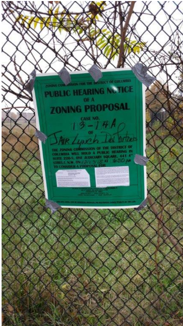
7. ZC 13-14A Posted 11-5-15 North Capitol Street NW