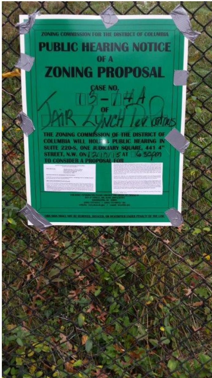
5. ZC 13-14A North Capitol Street NW Posted 11-5-15