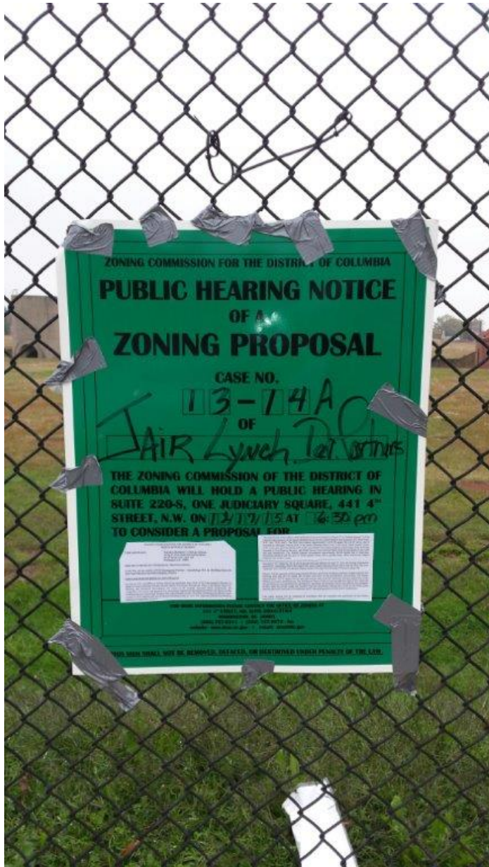
3. ZC 13-14A Michigan Ave NW Posted 11-5-15