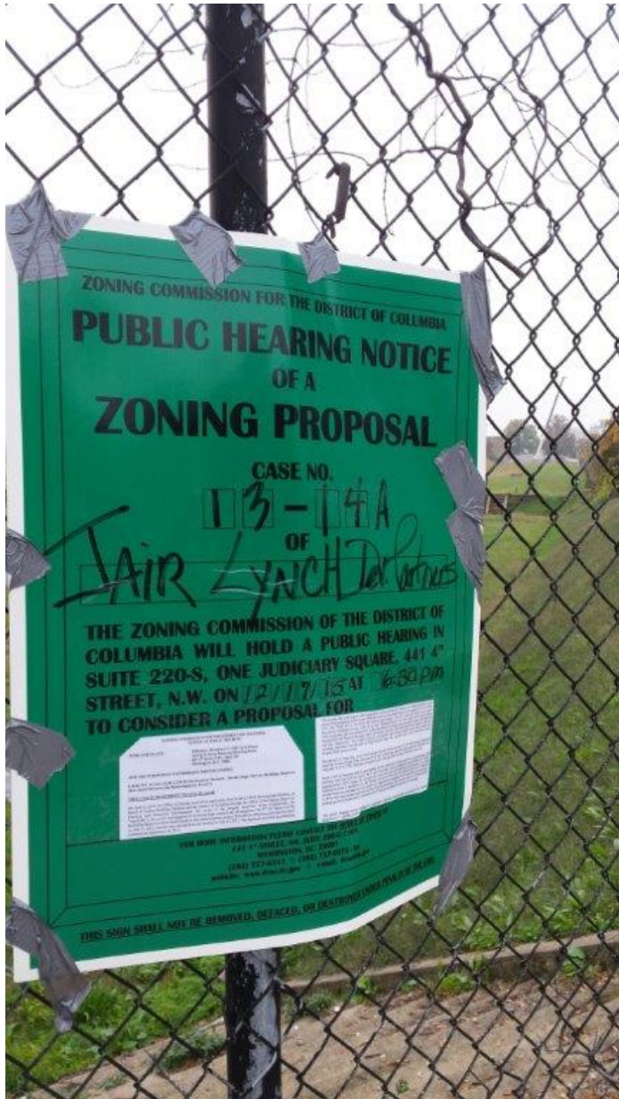
2. ZC 13-14A Michigan Ave and First Street NW Posted 11-5-15