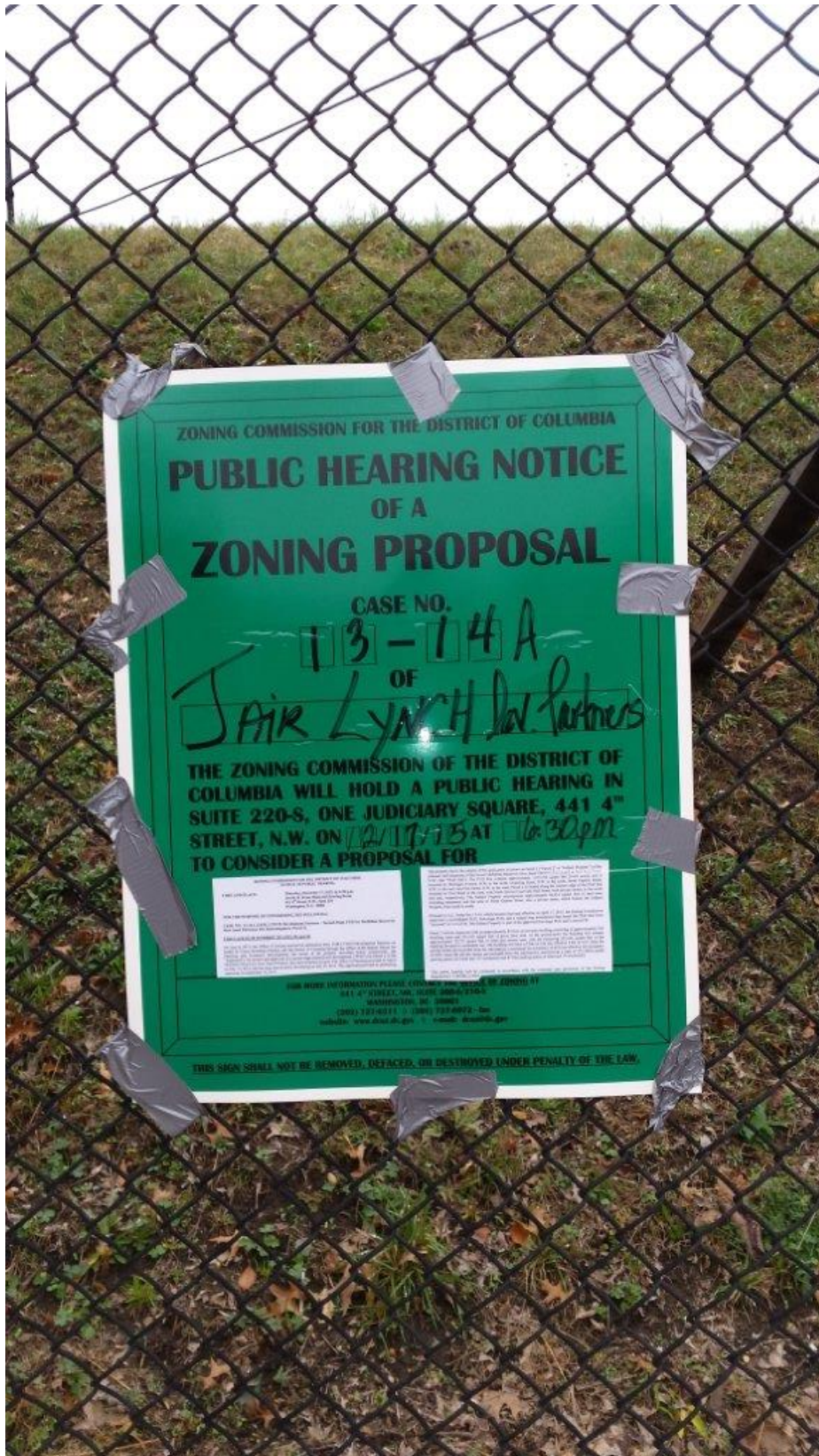
6. ZC 13-14A Posted 11-5-15 First Street NW